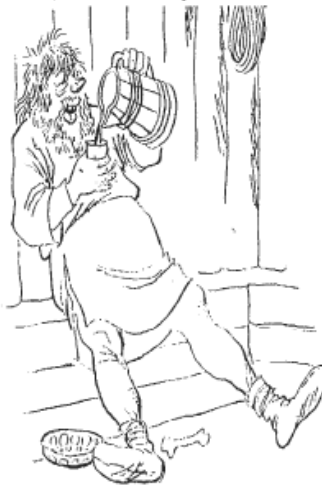
by Iamov du Bious H'Origins

Well, we're out of room for this issue, but make sure and read the next exciting installment Iamov's The Dregs. -ed